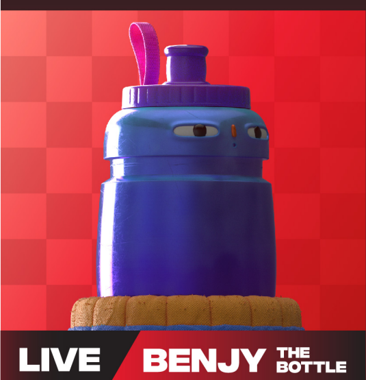
LIVE BENJY THE BOTTLE

Benjy The Bottle here - live from behind the scenes of Circuit de la Conoco.